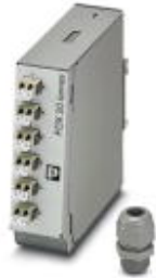
DIN rail splice box, without pigtails, for 6x LC duplex

Please be informed that the data shown in this PDF Document is generated from our Online Catalog. Please find the complete data in the user's documentation. Our General Terms of Use for Downloads are valid ( http://phoenixcontact.com/download )